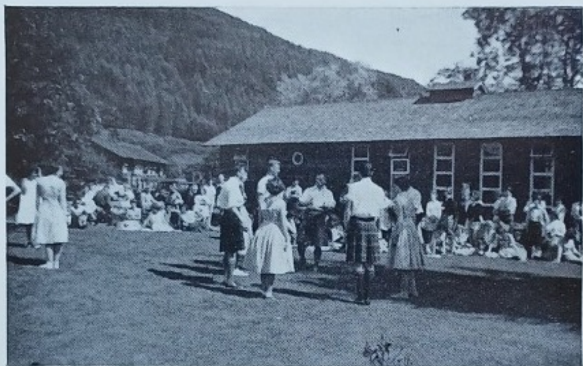
YOUTH CAMP, ABERTOYLE, 1960.