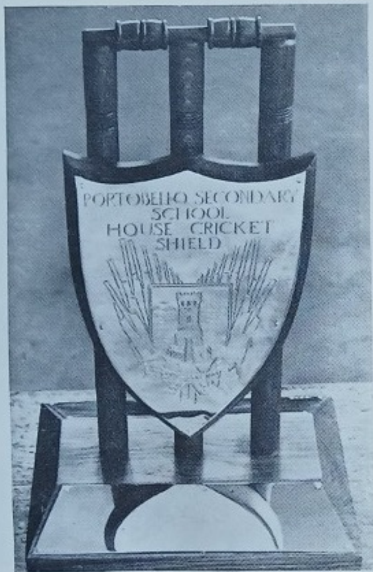
HOUSE CRICKET SHIELD.