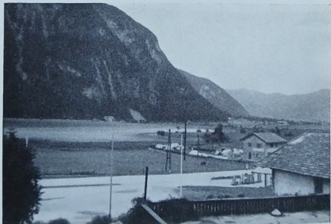
BUCHAU ON THE ACHENSEE, AUSTRIAN TIROL.