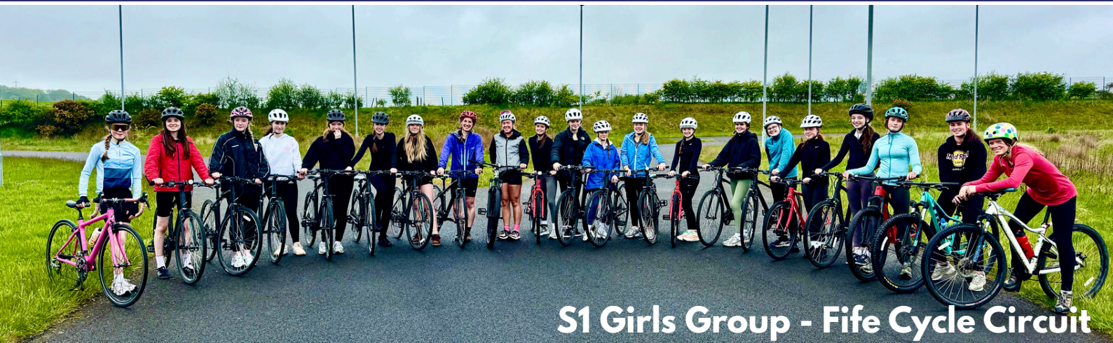
S1 Girls Group - Fife Cycle Circuit