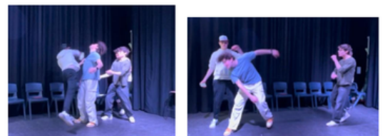
Slow-motion fight rehearsals ...!

It's fantastic to see so many young people from across the school working together creatively to bring the production to life. We can't wait for audiences to see the final performance in June!