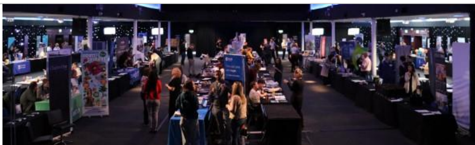
DYW Weekly Opportunities and Update 25/10/2023

https://sway.office.com/b20R6li87Uyx3bqg?ref=Link