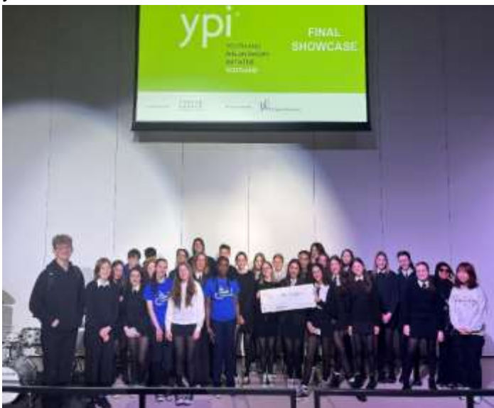
Our 2023 YPI Finalists

Our S2 were a fantastic audience and we cannot wait to see how they take the programme forward next year!