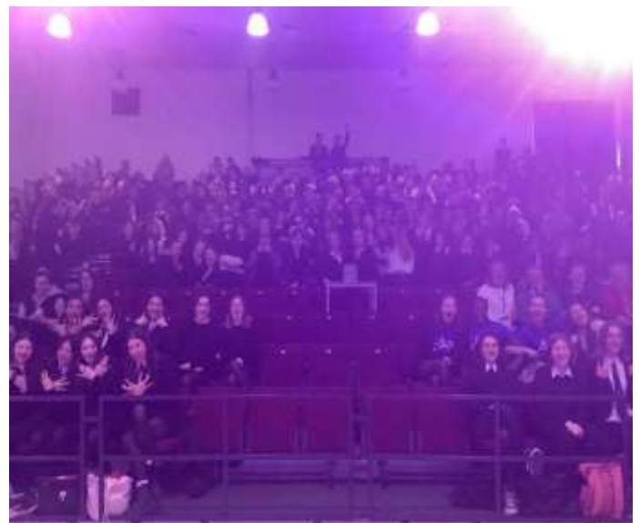
Our wonderful audience for the YPI Event